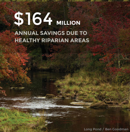
Long Pond / Ben Goodman

Monroe County's environmental resources supply our communities with sparkling clean drinking water, critical wildlife habitats, flood protection, and impressive recreational and tourism opportunities. The Monroe County Return on Environment Study demonstrates how open space and a healthy environment are integral to our economy, cost of living, and the well-being of our residents. By understanding nature's financial value, we are better equipped to strike an effective balance between protecting our natural resources and supporting smart economic growth.