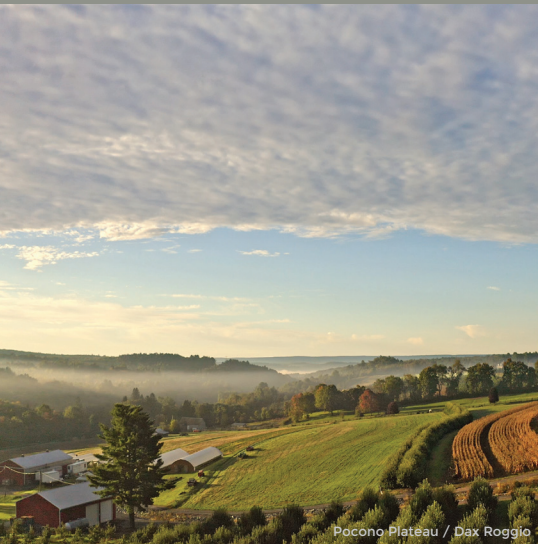
Pocono Plateau / Dax Roggio

$368 MILLION ANNUAL OUTDOOR RECREATION REVENUE