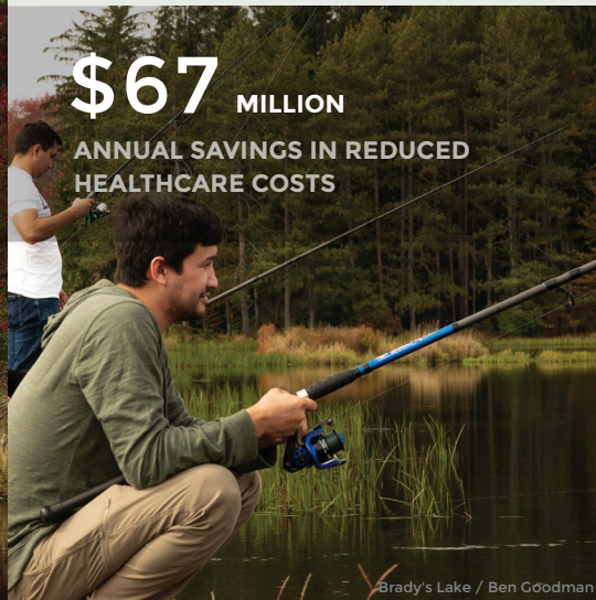
Brady's Lake / Ben Goodman

$164 MILLION ANNUAL SAVINGS DUE TO HEALTHY RIPARIAN AREAS