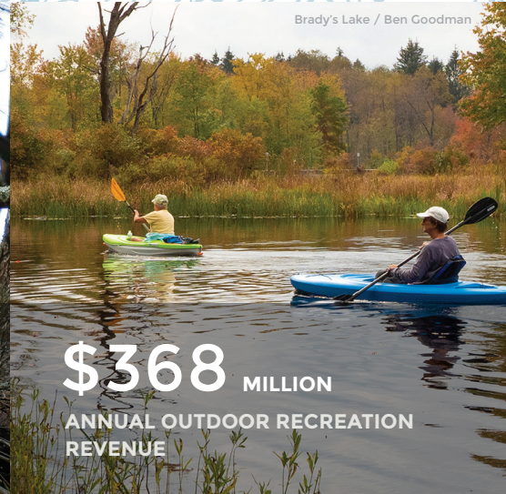
Brady's Lake / Ben Goodman

$1.1 BILLION ANNUAL COST SAVINGS BENEFITS PROVIDED BY NATURE