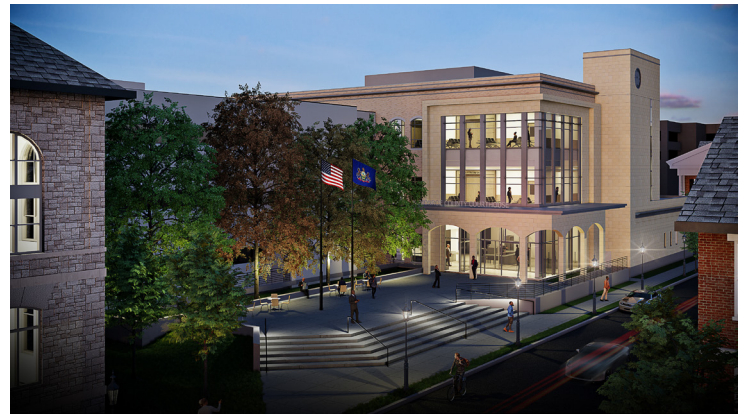
Renderings of New Monroe County Courthouse Expansion, Stroudsburg, PA.