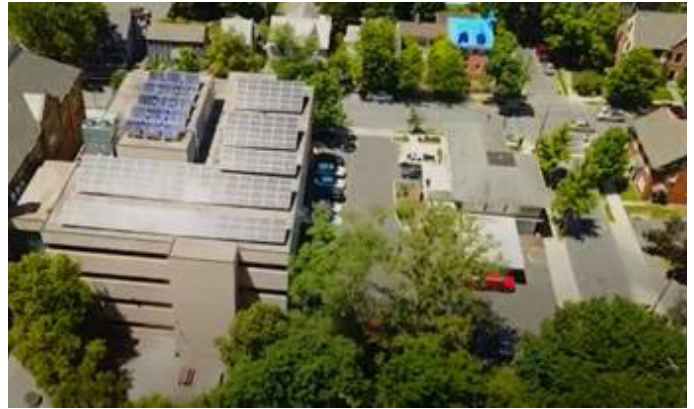
Aerial view of project site

The Courthouse Annex will be renovated in parallel with construction of the new Expansion and to the historic renovation for clerical and similar judicial offices for use by court administration, probation, custody conciliation, sheriff, prothonotary, clerk of courts, domestic relations, district attorney, and public defender.