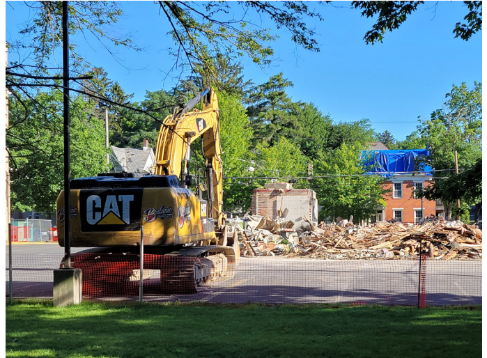
Demolition of the former bank building – site of the new Courthouse Expansion.

With the building removed and the site substantially cleared, construction contractors could begin work. Construction of the approximately $50 million project involves multiple prime contractors firms hired by Monroe County including: